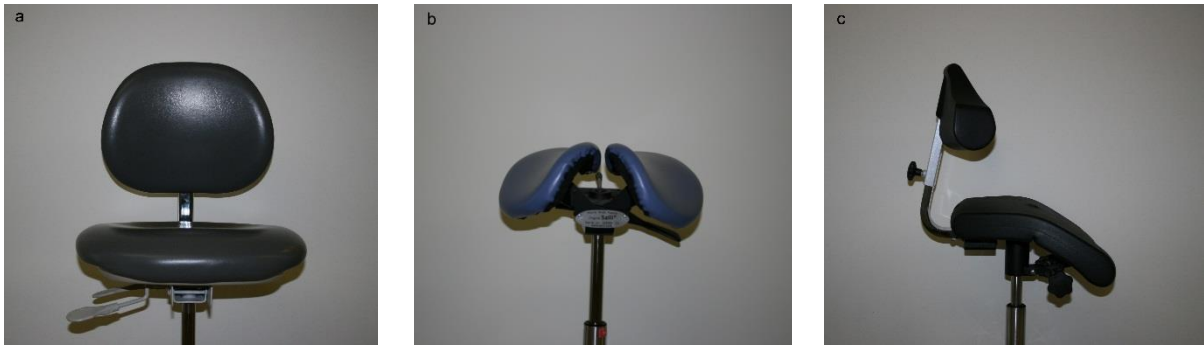
Fig. 1a: A-DEC DOCTOR'S STOOL, b: SALLI MULTIADJUSTER, c: GHOPEC JUNIOR